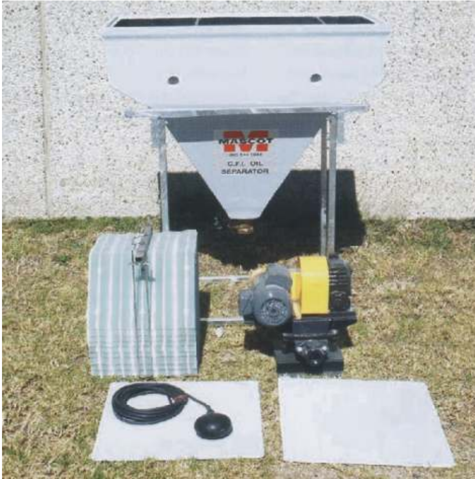
Approved: GRC Oil & Water Separator with Plate Pack, Pump and Float Switch

Mascot Engineering Group is the only company to have all of the following products approved by Sydney Water: