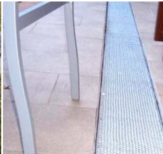
GMS Heelproof Trench Grate & Frame