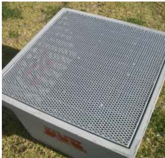
GMS Heelproof Drop-in Grate to suit all Mascot GRC Pits