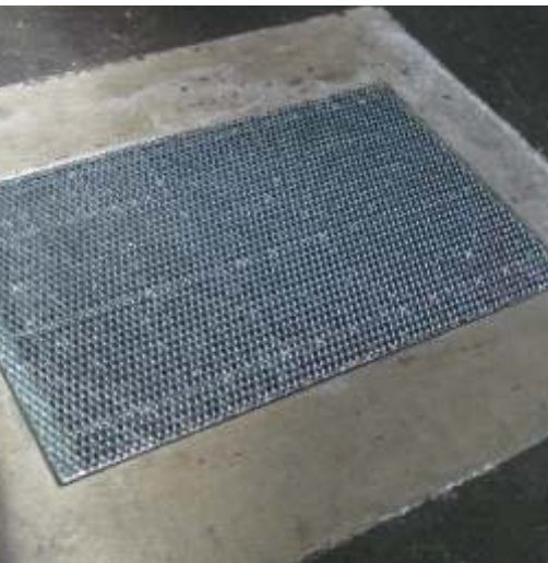
GMS Heelproof Grate & Frame